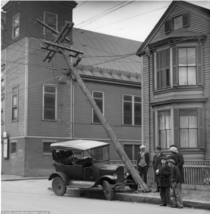
This car remarkably survived a collision with a utility pole in Cambridge, Mass - with just a mangled bumper to show for the crash