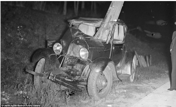
The driver of this car was unlikely to have survived this collision. The wreck is wrapped entirely around a tree, which sits in the driver's position