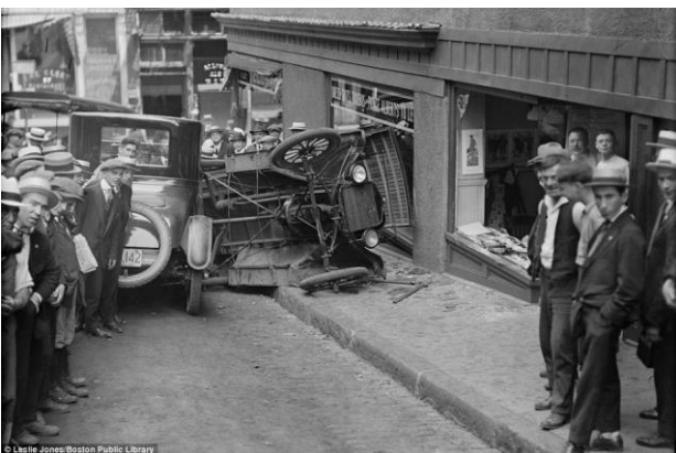
Photographer Leslie Jones had to part crowds of onlookers to capture this accident in downtown Boston. An out-of-control car collided with a shopfront, smashing windows and ending up on its side.