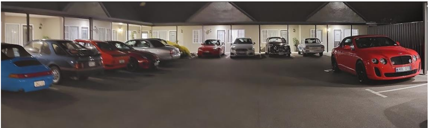
Parked up for the night in Greymouth