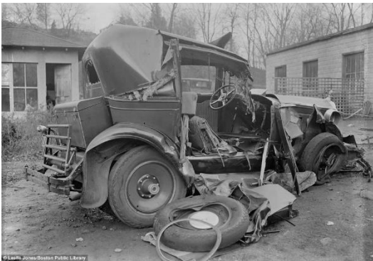
Sitting in a Boston wrecking yard, this cross section of a wreck shows how basic car interiors were in the early days of motoring.