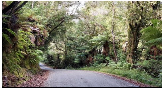
Drive around Lake Kaniere