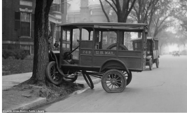
Even public servants weren't immune to accidents. An early mail truck came out loser in this battle with a tree on the tree-lined Commercial Avenue, Boston