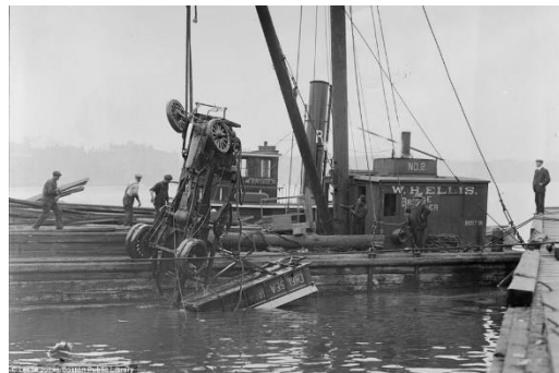
The shell of a truck is pulled from the Charles River after it careered off the Harvard Bridge