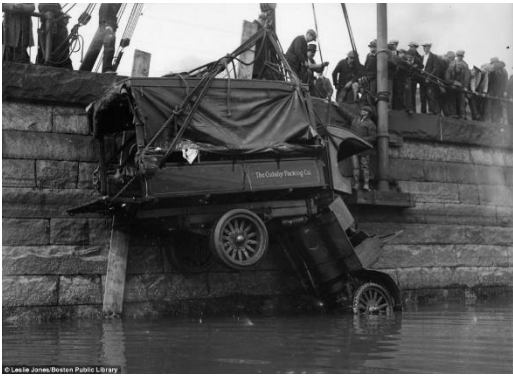
A Cudahy Packing Co. truck is hauled out of Fort Point Channel, which separates South Boston and downtown Boston,