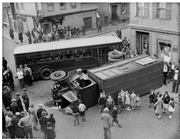
Another view of the same accident shows eager children posing with the upturned truck. It also demonstrates how close the vehicles came to nearby buildings.