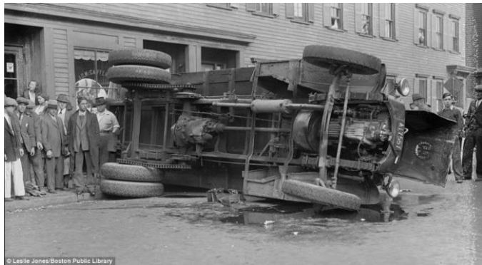
A truck collided with a bus and flipped over in south Boston, stopping just before it smashed into a cafeteria storefront