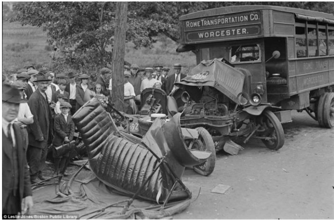
Local businessman Byron Harwood and Byron Grover were hurt when their car collided with a bus in Waltham, Mass. in 1921. They were lucky to survive this nasty looking wreck. Their car certainly didn't