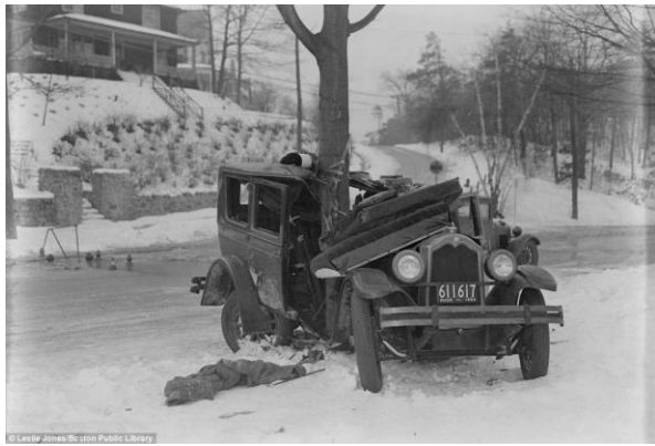
Taken in 1934, this photo shows a car that skidded out of control on ice-covered roads and wrapped around a tree in Auburndale, Mass.